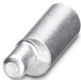
Cable lug for HEAVYCON-MODULAR; PE connection extension to 16 mm 2 , for crimping with crimp pliers

Please be informed that the data shown in this PDF Document is generated from our Online Catalog. Please find the complete data in the user's documentation. Our General Terms of Use for Downloads are valid ( http://phoenixcontact.com/download )